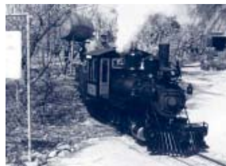
Scale-model steam engine and railroad cars attract visitors to the Hillcrest Farm near Reedley.